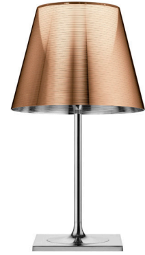
FU630346 Aluminized Bronze