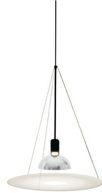
① FU250000 Nickel