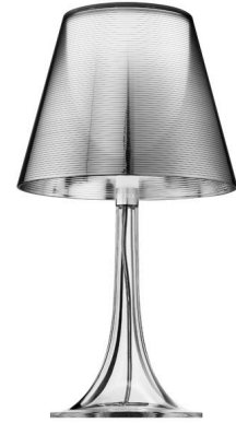
FU625500 Aluminized Silver