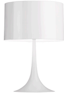
○ FU661109 Shiny White