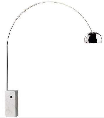
F0303000 Stainless steel