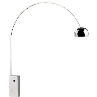
F0303000 Stainless steel