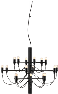
AU135031 Matte Black